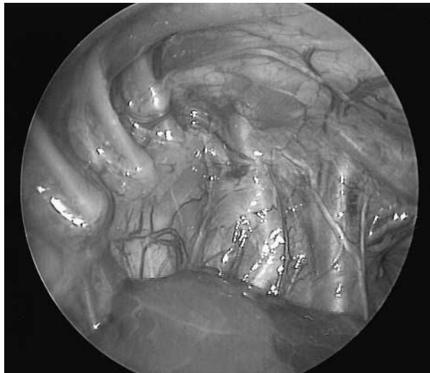
Fig 3. Internal view of the apex of the right chest. The collapsed lung is at the inferior part of the picture. More proximal and medial the superior caval vein accompanied by the phrenic nerve is seen. Posteriorly, the heads of the ribs can be seen making contact with the vertebral column.

proximal esophageal blind pouch was opened and mobilized (fig 4). For guidance, the anesthesiologist pushed on the double lumen tube in the proximal esophagus. Grasping of the esophagus was avoided. The cleavage plane between the proximal esophagus and trachea was only approached after the proximal esophagus had been mobilized as far as possible. The cleavage plane always was opened above the distal end of the pouch where there are no connecting muscle fibers between the pouch and the trachea. By doing so, the distal connecting muscle fibers could be identified and transected without damage to the pouch or trachea.