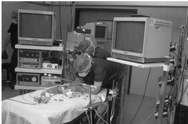
Fig 1. The patient is placed in a 3/4 left prone position. Two television screens are positioned at either side of the upper end of the table.

regional anatomy was obtained with the vena cava and overlying phrenic nerve anteriorly and the vertebral column posteriorly (Fig 3). The vagus nerve was seen clearly and used as a guide to identify the esophagus. The azygos vein was freed and preferably transected between 000 Vicryl ligatures. Next the mediastinal pleura behind the