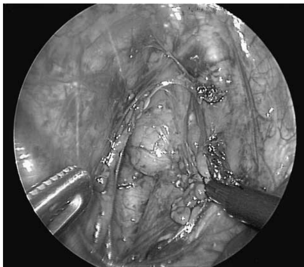
Fig 4. The posterior pleura has been incised, and the proximal esophageal pouch is being mobilized. Muscle fibers connecting the proximal esophagus with the trachea are seen clearly.

The site of the distal fistula was suspected by the expansion during