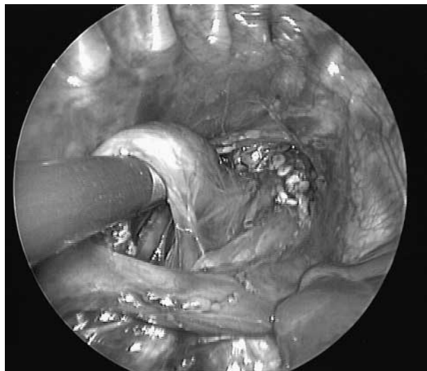
Fig 5. The distal esophagus has been dissected free just at the site of the fistula. The azygos vein is still intact.

inspiration. The most proximal end of the distal esophagus was isolated as close to the trachea as possible to avoid transection of vagal nerve branches to the distal esophagus (Fig 5). Next, the fistula was ligated with 00 Vicryl and transected distal to the ligature (Fig 6). The proximal esophagus then was opened, and an anastomosis was performed over a 6F or 8F nasogastric tube with interrupted 5-0 Vicryl and knotted within the chest. It is best to start the anastomosis at the left side of the esophagus. Starting the anastomosis on the right side obscures vision and makes the left part of the anastomosis more difficult. By leaving the end of a suture a little longer, traction can be applied so that the next suture can be placed more easily.